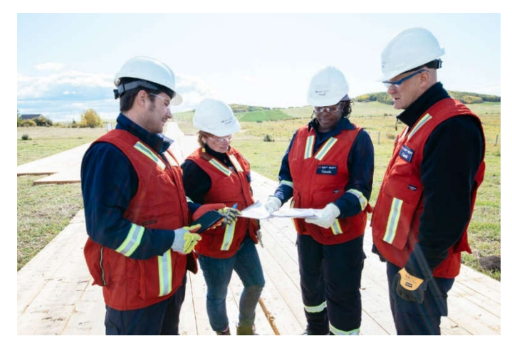
Figure 5 CER Inspectors reviewing a map along a right-of-way.

While the CER regularly reviews its regulations, the scope of these reviews tends to vary. This particular review however, is the first ever comprehensive review of the OPR and our objective is to deliver a regulation that: