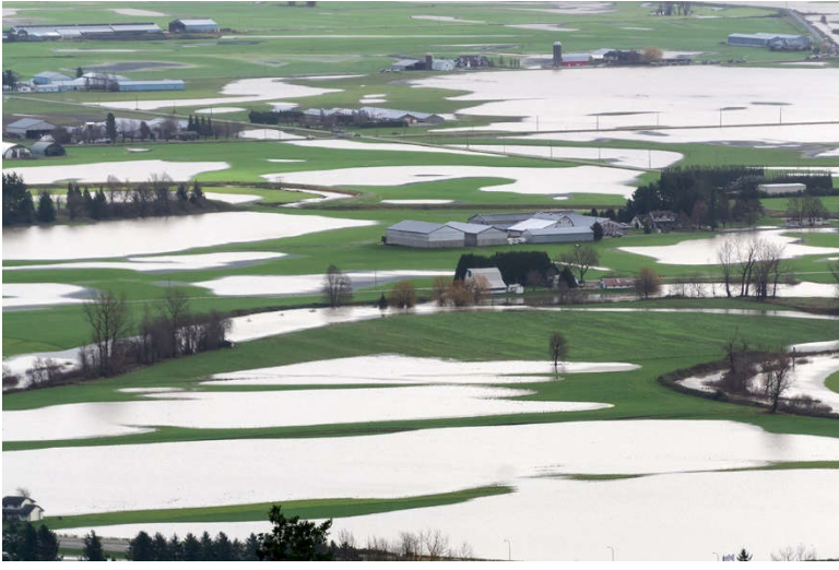
Figure 6 Flooded farmland in British Columbia.

Natural disasters are harrowing and can be really frightening when they impact your family, property and livelihood. The effects of the fires, floods and landslides in British Columbia in 2021 will be felt by those landowners for a long time. These disasters can change contours and topography of the land through erosion, scour and debris left behind, and the drainage that was present before the disaster may not be there anymore.