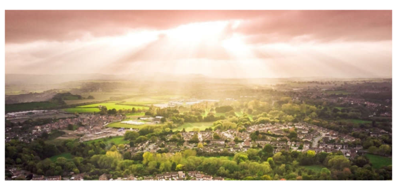
Figure 3: Rays of sunshine over a mix of urban developments and agricultural lands.

The report covers all provinces and territories, and all energy commodities like oil, solar, wind, and more. This year and for the first time, the report also features net-zero modelling.