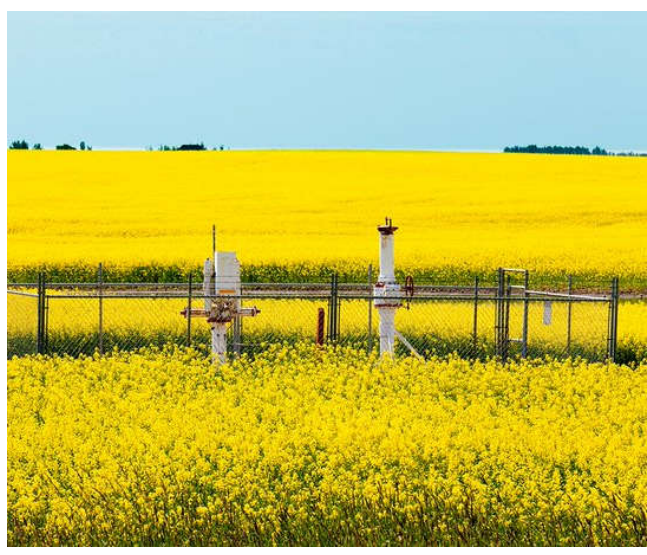
Figure 2: Valve site in a canola field.

In the past, the usage of the term "damage prevention" in CER lands publications could be perceived as misleading because it also referred to damage to property. "Damage prevention" is a term that is commonly used across industry, utilities, the excavating community and by regulators worldwide, including the CER's own Damage Prevention team, and it describes the prevention of damage to buried infrastructure. To provide greater clarity, the CER utilizes the term "property damage", which now refers specifically to the prevention of damage to a landowner's property. For more information on this topic, go to "Damage Prevention".